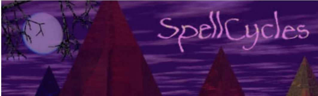
Free Game # 57 from Invisible City Productions, Inc.